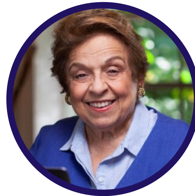
Hon. Donna Shalala Director